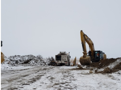
Description & Location:

Photo facing West. SF 27 West side of Cypress #1 Refueling truck is onsite refuelling equipment.