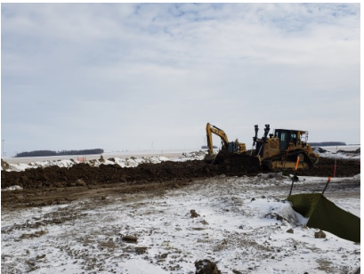
Description & Location:

Photo facing North East. SF 48A (KP994+310) Excavators and a dozer are working together to backfill tie in trench.